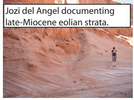
Jozi del Angel documenting late-Miocene eolian strata.

STRATIGRAPHY: Stratigraphic column of Miocene-Pliocene strata, showing representative photographs, major lithofacies boundaries, and magnetostratigraphic ages (in boxes at right) of major contacts.