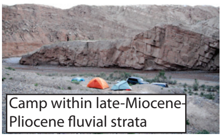
Camp within late-Miocene-Pliocene fluvial strata