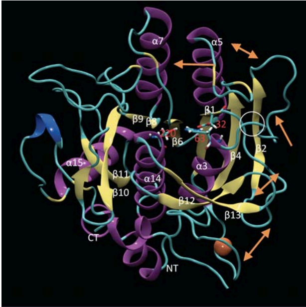
Protein Structure Network