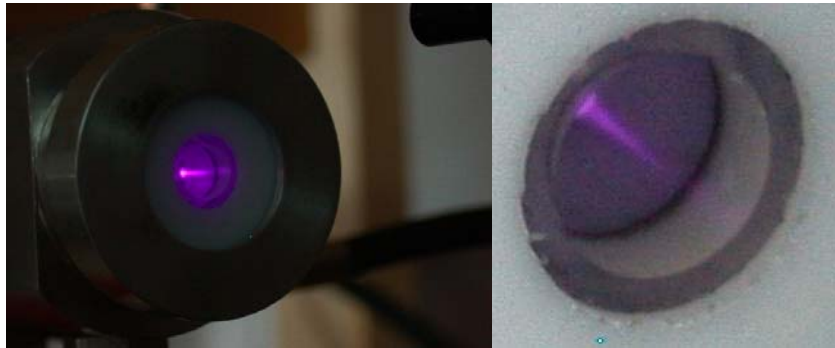
Figure 2. Single Capillary Reactor with the characteristic plasma jet.